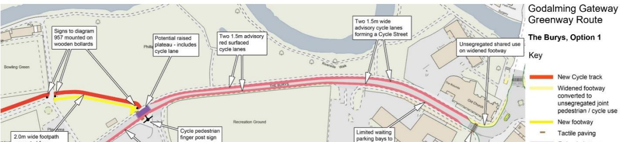
Figure 4: The Burys on-carriageway option proposes a 'cycle street' approach. This would see the centre line removed and replaced by advisory cycle lanes each side of a central motor vehicle lane. It avoids the need for a shared-use path at the eastern end of the route where pedestrian footfall is highest.

1.7 At public consultation only 22% of respondents to The Burys route supported neither option. 42% expressed support for the off-road segregated track against 25% supporting the 'cycle street' option. Conversely the special interest groups (Sustrans and FoE Godalming) favoured the cycle street option. Godalming Cycle Campaign favoured the off-carriageway option whilst acknowledging that a well implemented cycle street option provided clear safety and priority improvements, encouraging cycle use.