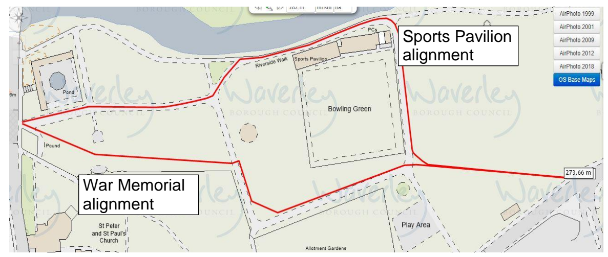
Figure 2: Phillips Memorial Park alternatives alignments considered following public consultation.

In response, Waverley officers, along with the Godalming Town Clerk, carried out a site visit to look at 2 alternative alignments through the western end of Philips Memorial Park. As Shown in Figure 2, one alignment involved creating a new path behind the benches overlooking the bandstand but between the War Memorial and flagstaff (the War Memorial alignment). The second alignment was slightly longer, widening existing paths to direct cyclists north of the bowling green and sports pavilion (the Sports Pavilion alignment).